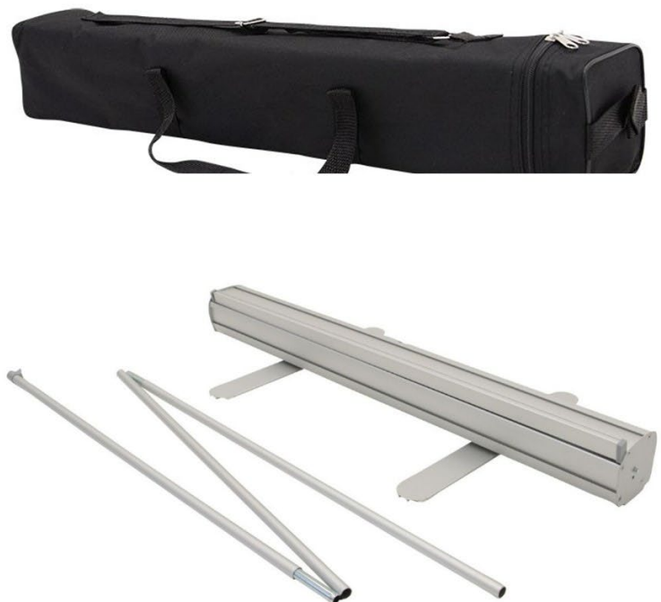
546-520—Banner Stand kit sample